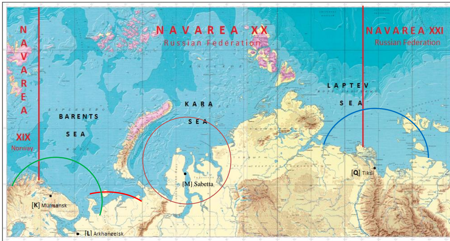
Coverage areas NAVTEX stations in sea geographic areas NAVAREA XX and XXI