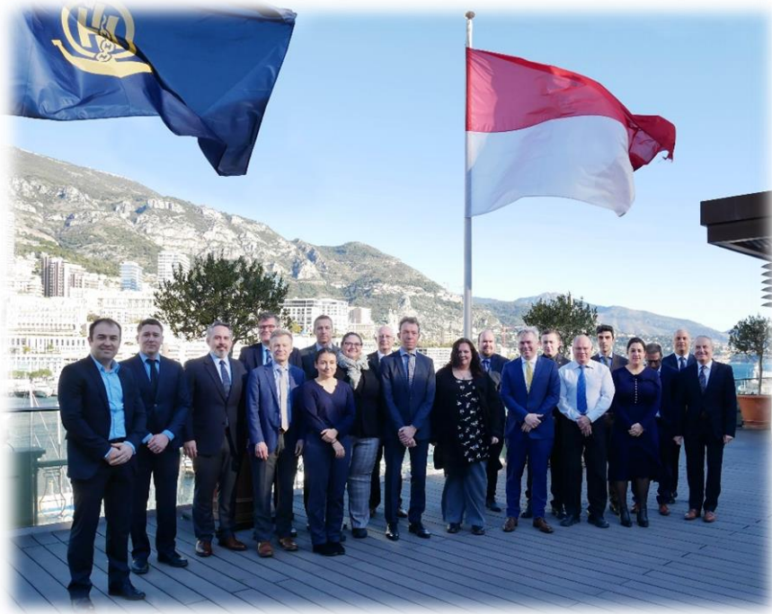
Participants in the DQWG-15 meeting, IHO Secretariat, Monaco