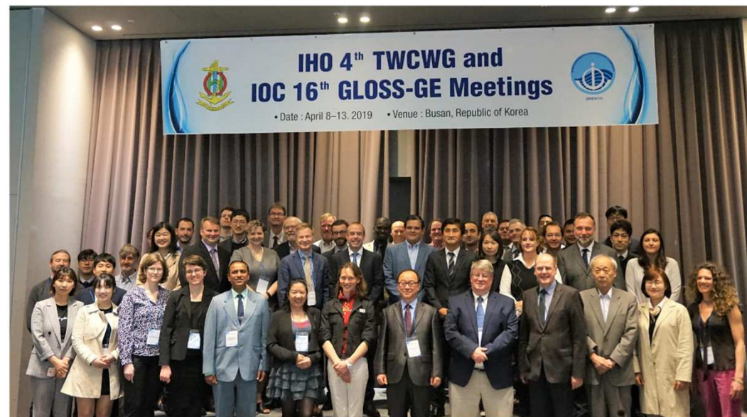
4 th meeting of the Tides, Water Level and Currents Working Group (TWCWG) Busan, Republic of Korea – 8-10 April 2019