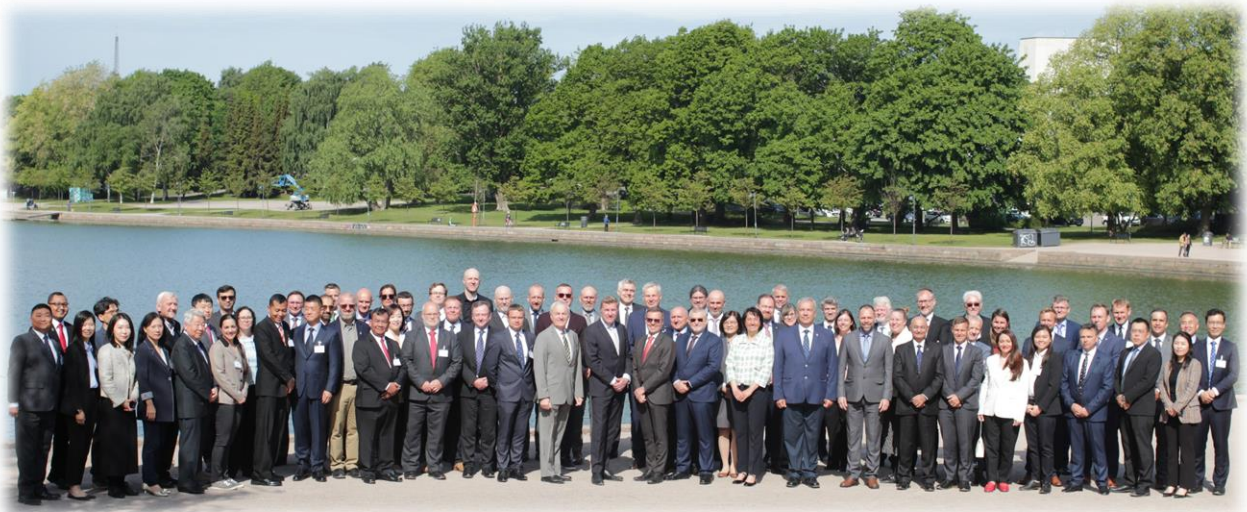
Participants in HSSC-15