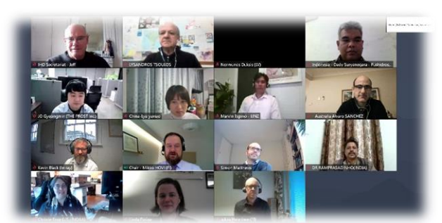
Some participants at NCWG-7

Germany reported on a booklet<sup>2</sup> presented in the margins of the UN-GGIM meeting in August and developed by the International Cartographic Association together with the United Nations Geospatial Information Section. This booklet covers several Sustainable Development Goals (SDG). It is proposed that the IHO gets involved in the next edition, when planned, in order to encompass marine cartography, ocean mapping and hydrography, in particular in support of SDG14).