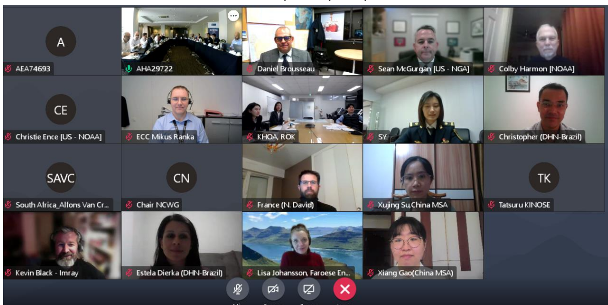
Some NCWG8 on-line participants