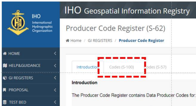
Figure 1 - S-100 Producer Code Interface

The maintenance procedure for S-57 ENC producer code hasn't changed which means the request to addition/modification should be sent out to the register manager via the email. Unlike those of the S-57 code application, the registration of the S-100 code must be processed through the web interface of the GI registry.