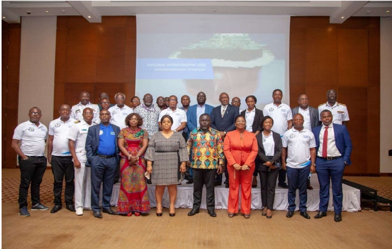
Participants at the World Hydrography Day Conference