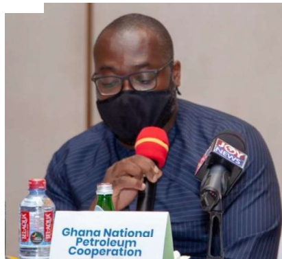
The Deputy Chief Executive (Technical Operations) of the Ghana National Petroleum Cooperation