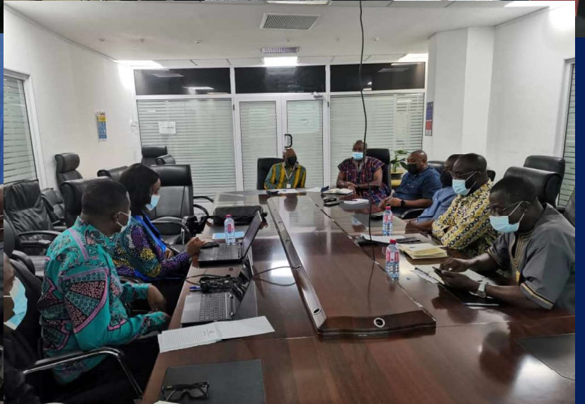
GHANA PORTS AND HARBOURS AUTHORITY