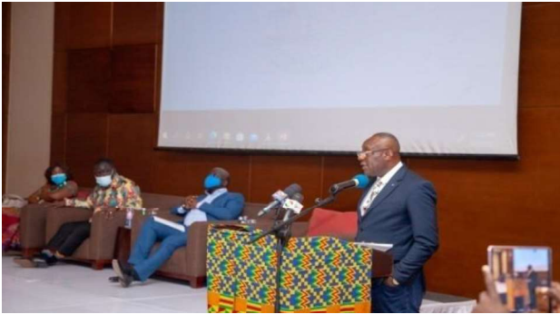
Hon. Kokofu of the Environmental Protection Agency delivering his solidarity speech