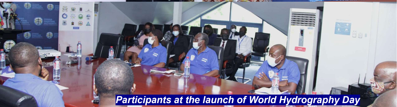
Participants at the launch of World Hydrography Day