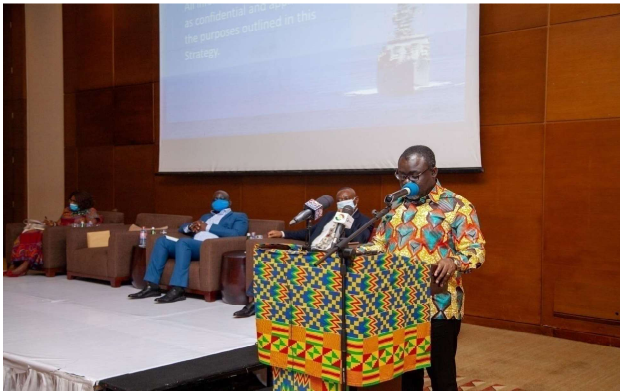
Keynote Address by the Honourable Minister of Transport