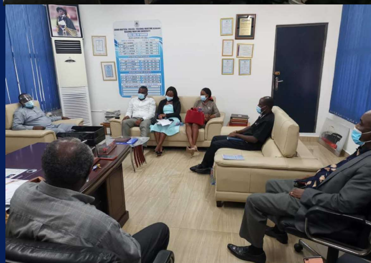
REGIONAL MARITIME UNIVERSITY