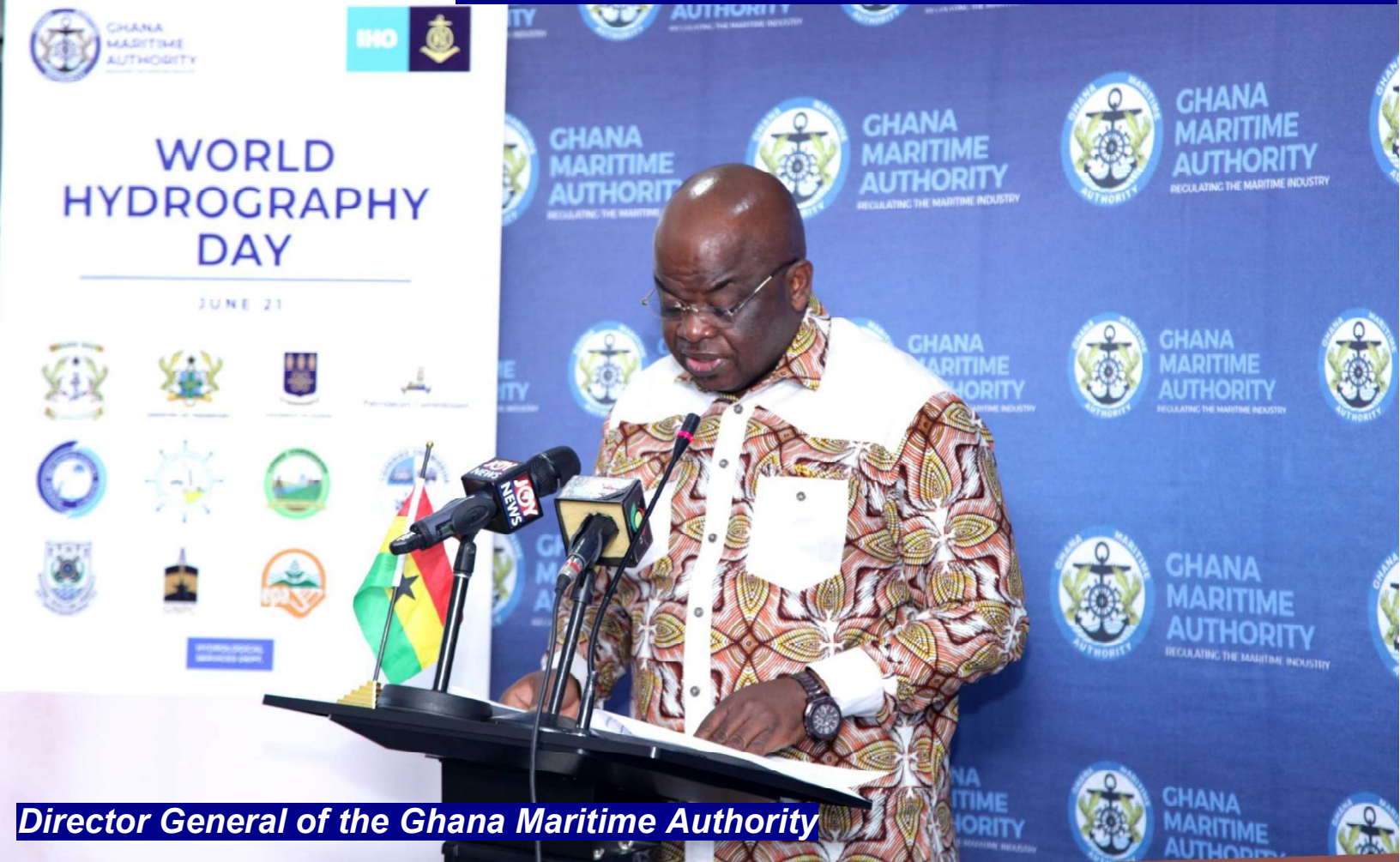
Director General of the Ghana Maritime Authority