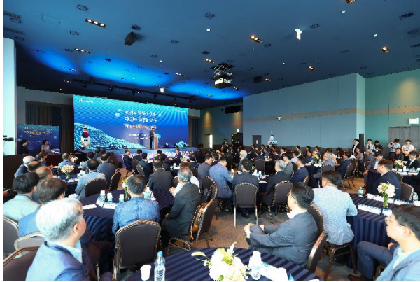
Participants at the 3rd Hydrography Day in ROK