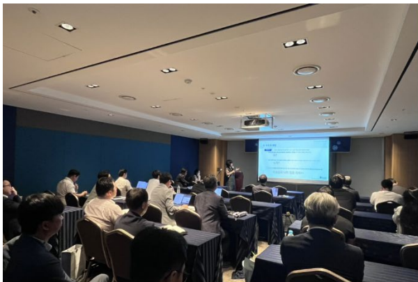
Academic conference on latest hydrographic technology and information