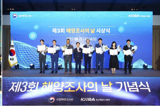
Recipients of Commendation by Minister of Oceans and Fisheries for Distinguished Contribution to Hydrography